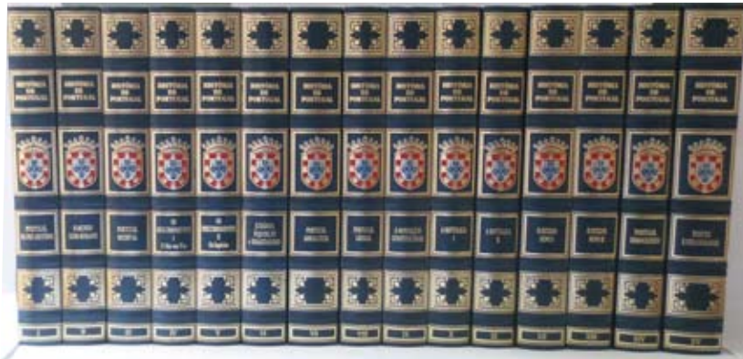
Item 14 (greatly reduced)